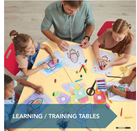
LEARNING / TRAINING TABLES