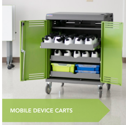
MOBILE DEVICE CARTS