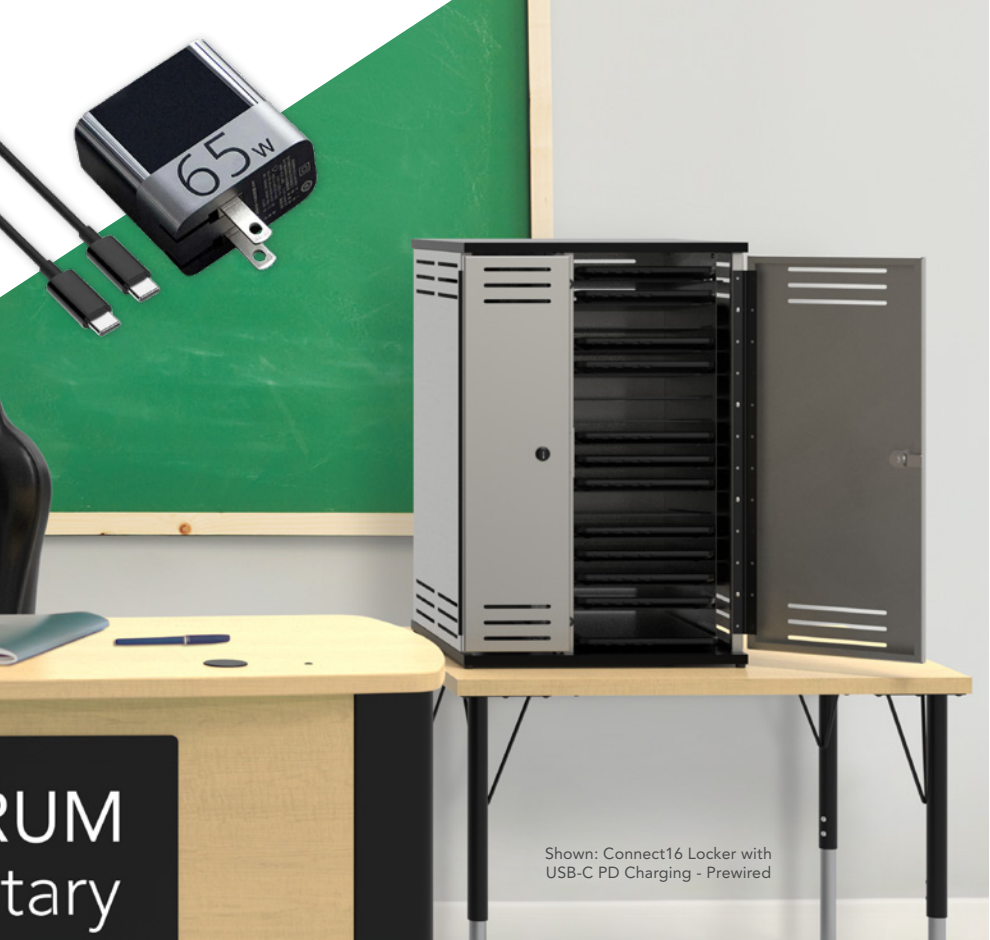
Shown: Connect16 Locker with USB-C PD Charging - Prewired

The Quick and Easy Way to Get Integrated