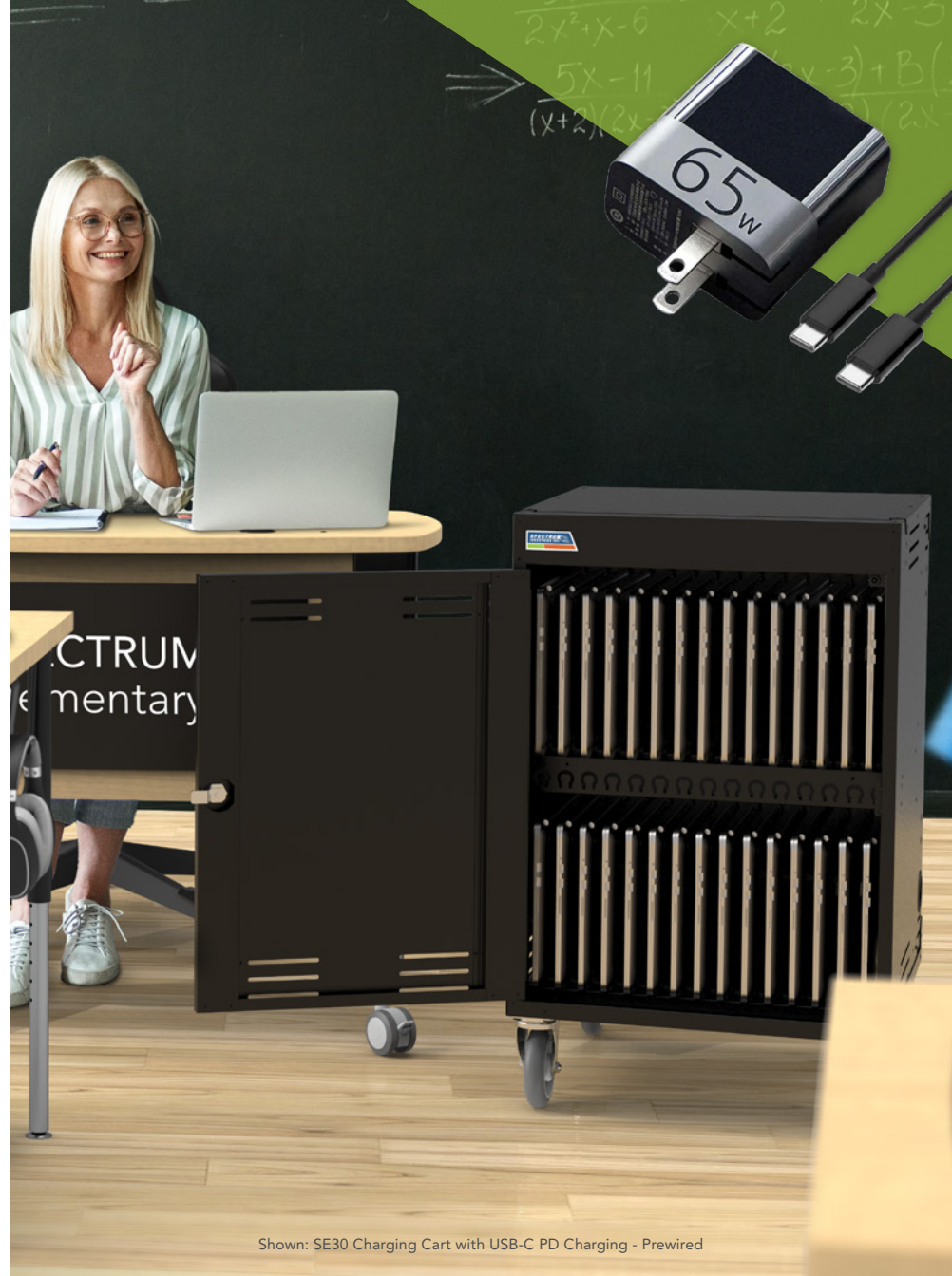
Shown: SE30 Charging Cart with USB-C PD Charging - Prewired