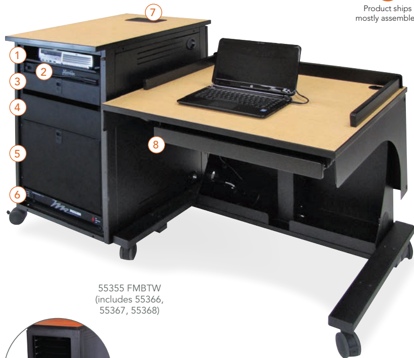
55355 FMBTW (includes 55366, 55367, 55368)