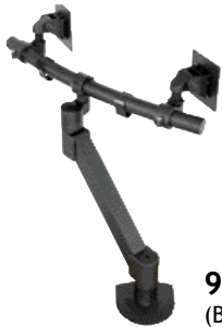
95516 B (Black)