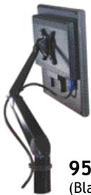
95514 B (Black)