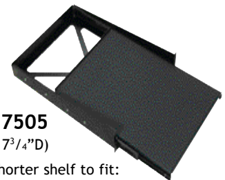
97505 (17 3 / 4 "D) Shorter shelf to fit: - Compact Presentation Lectern - Flat Screen Carts - Evolution TIC