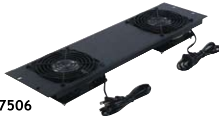
97506 (17 3 / 4 "D)