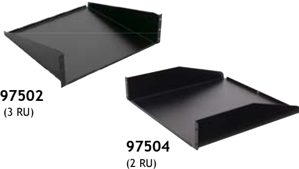
97502 (3 RU)

The Cantilever Shelf was developed to provide a handy shelf that mount via rack rail in carts and lecterns. 97502 utilizes three RU's and 97504 uses two RU's.