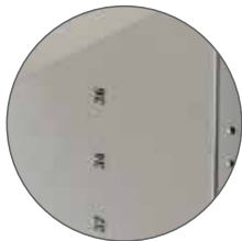
Set-and-Go HEIGHT INDICATORS