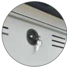
DOUBLE-BOLT KEYED SECURITY LOCK