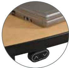
eLIFT HEIGHT ADJUSTMENT BUTTON