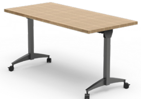
Shown: Flex Active Flip Table (37319)

Laptops & accessories not included. Options shown.