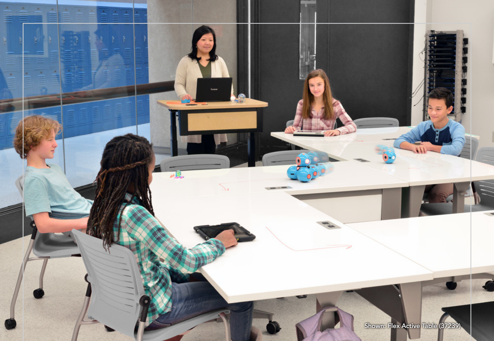
Shown: Flex Active Table (37239)