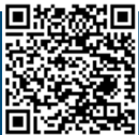
Flex Active Table