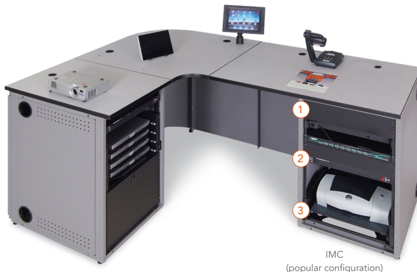
IMC (popular configuration)