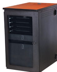
36"H Equipment Rack consisting of 68157 B and 68200 CH