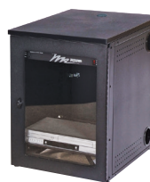
29"H Equipment Rack consisting of 68107 B and 68200 I

68204 Flip-Up Shelf is for use with full lectern only. Cannot be used with stand alone equipment rack.