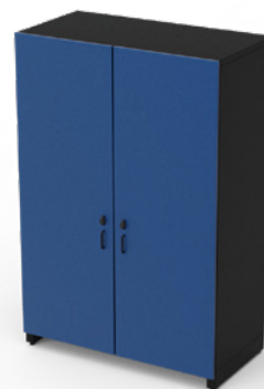
Shown: SC48 (24026)

Monitor, laptops & accessories not included. Options shown.