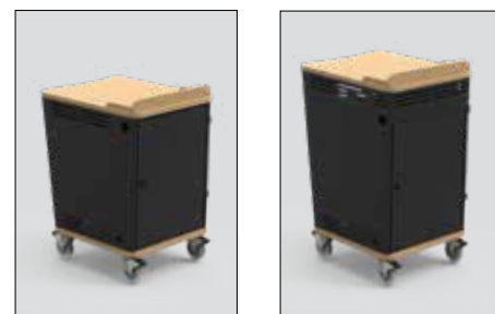
ORDER CODE 36 36" Worksurface Height ORDER CODE 42 42" Worksurface Height