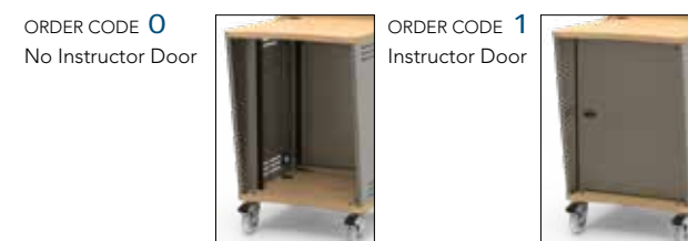
ORDER CODE 0 No Instructor Door ORDER CODE 1 Instructor Door