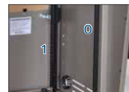
ORDER CODE 0 No Rear Rack Rail ORDER CODE 1 Rear Rack Rail