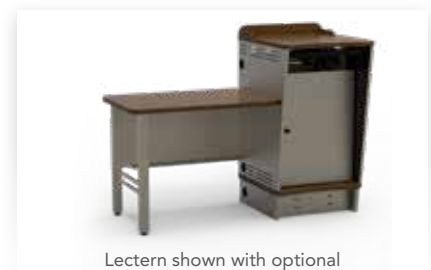
Lectern shown with optional Side Table 55413, and Instructor-Side Door 55405*