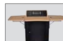
ORDER CODE 4 Flip-Up Shelf, Left and Right ORDER CODE 9 Flip Up Shelf Right & Left Chalk White Dry Erase