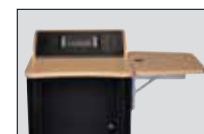
ORDER CODE 2 Flip-Up Shelf, Right ORDER CODE 7 Flip Up Shelf Right Chalk White Dry Erase