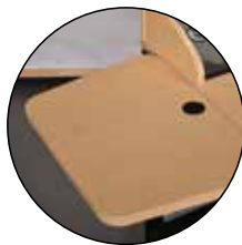
OPTIONAL FLIP-UP SHELF ADDS ADDITIONAL WORKSURFACE