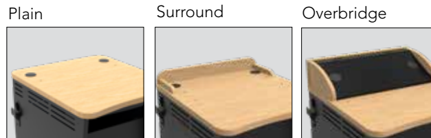
Plain (as shown) ORDER CODE P1 Surround (as shown) ORDER CODE S1 Overbridge (as shown) ORDER CODE B1 Plain Custom Cutouts* ORDER CODE P2 Surround Custom Cutouts* ORDER CODE S2 Overbridge with Custom Cutouts* ORDER CODE B2 Plain Power Module ORDER CODE P3 Surround Power Module ORDER CODE S4 Overbridge & EM Wireless Charging ORDER CODE B3 Plain Power Module & EM Wireless Charging ORDER CODE P4 Surround Power Module & EM Wireless Charging ORDER CODE S5 Plain EM Wireless Charging Pad ORDER CODE P5 Surround EM Wireless Charging Pad ORDER CODE S6

*Standard cutouts available to support popular AV/IT Technology from major suppliers. Please visit www.spectrumfurniture.com to configure your lectern with the cutouts you need.