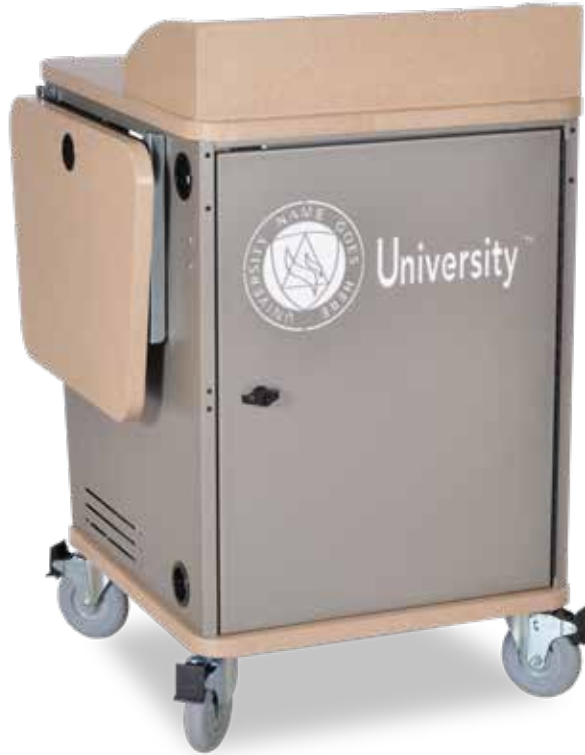
Lectern 55411 shown with optional Flip-Up Shelf, Logo Door, and Overbridge Control Console™

Worksurface Available with EM Wireless Charging Pad!