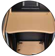
CONTOURED WORKSURFACE FOR PRESENTER COMFORT