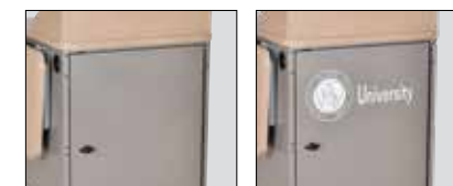
ORDER CODE 0 No Logo Panel ORDER CODE 1 Custom Logo Panel with Matching Laminate ORDER CODE 2 Custom Logo Panel with White Laminate ORDER CODE 3 Custom Logo Panel with Black Laminate

Custom logo will increase lead time and additional charges will apply.