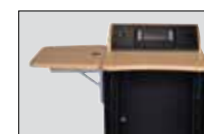
ORDER CODE 3 Flip-Up Shelf, Left ORDER CODE 8 Flip Up Shelf Left Chalk White Dry Erase