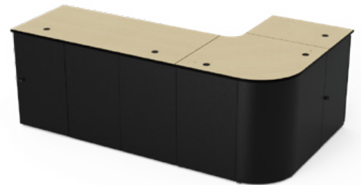
Shown: IMC Console 4 (68027)

The Instructor Media Console (IMC) teaching desk's versatile, modular design offers the flexibility to change with your instructional and technological needs.