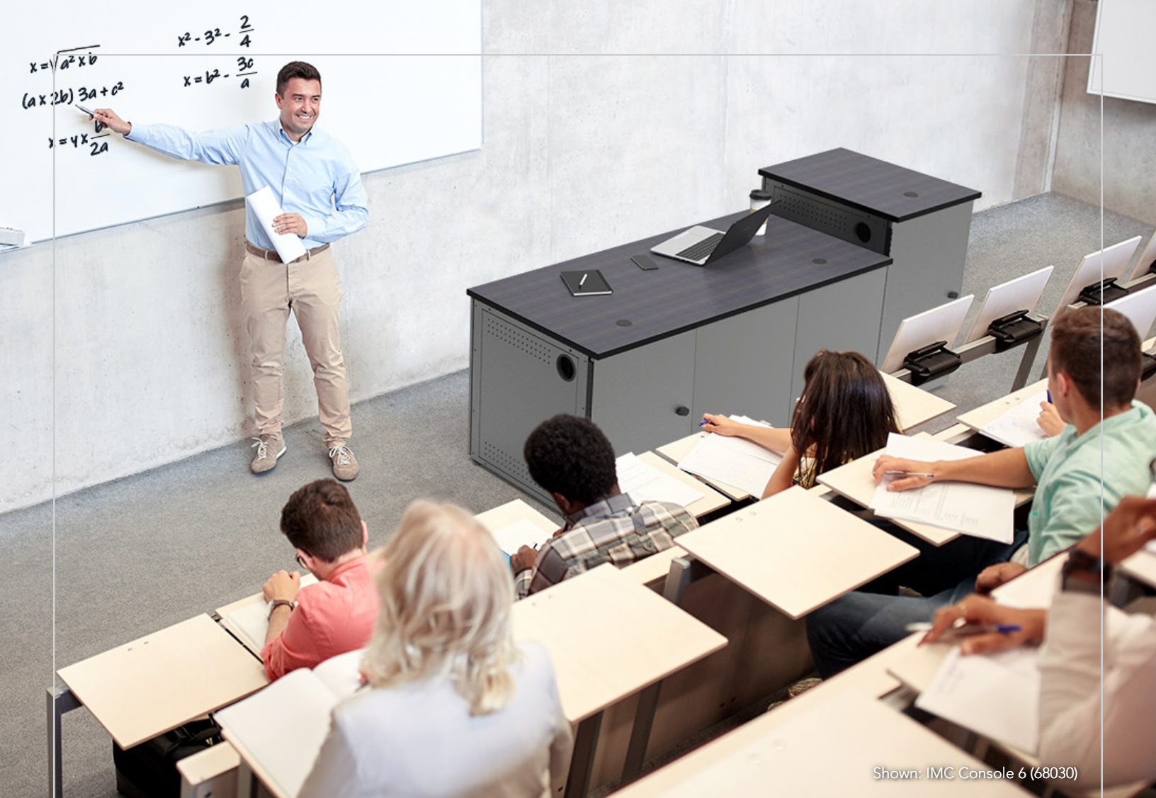
Shown: IMC Console 6 (68030)