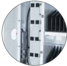
LOCKABLE POWER COMPARTMENT