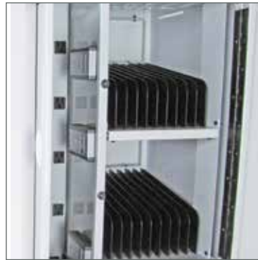
POWER OUTLETS AND OPTIONAL USB HUBS (LEFT) ARE SEPARATED FROM THE TABLET BAYS IN THEIR OWN COMPARTMENT.