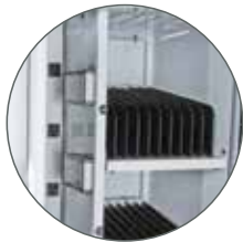
OPTIONAL USB HUB SYNCING (55448)