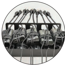
REMOVABLE WIRE AND QUICKBRICK™ TRAYS