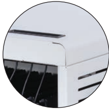
ALL-STEEL CONSTRUCTION, WITH INTEGRATED HANDLES