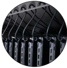
OVERHEAD WIRE MANAGEMENT