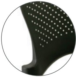
PERFORATED BACKREST (Standard)