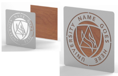
Logo with matching laminate backer