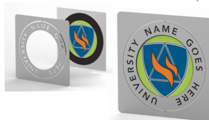
Logo with outline image laser cut in logo panel and entire image printed