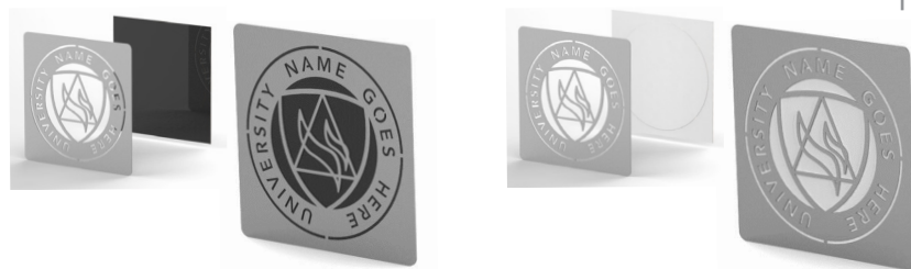
Logo with black backer