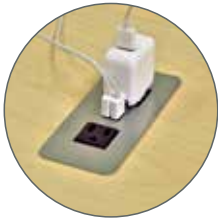
OPTIONAL COVE POWER/COMM MODULE (99044)