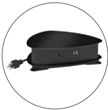
OPTIONAL DRIFTER POWER MODULE (99040)