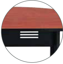
OPTIONAL MODESTY PANEL (37112)