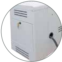
EFFICIENT, NATURAL "CHIMNEY EFFECT" VENTILATION