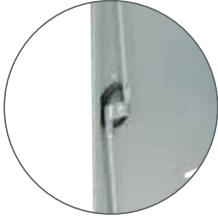
TWO POINT DOUBLE-BOLT LOCK