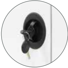
DOUBLE-BOLT KEYED SECURITY LOCK