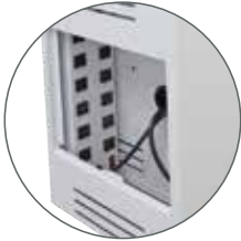
LOCKABLE POWER COMPARTMENT